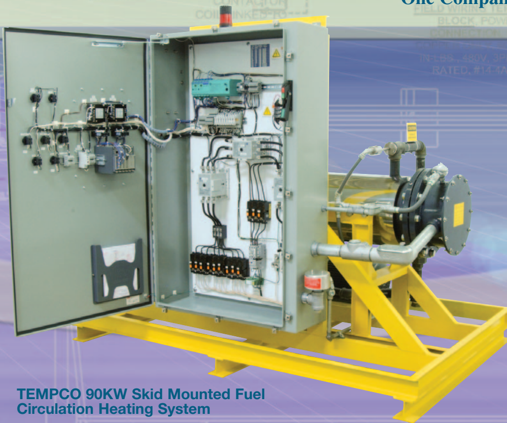
TEMPCO 90KW Skid Mounted Fuel Circulation Heating System

Achieve your goals with TEMPCO. One Company, One Solution.